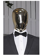
NEOBLU TEDDY 03201