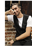
NEOBLU LUCAS MEN 03184