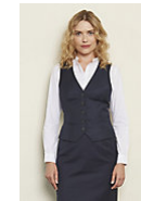
NEOBLU MAX WOMEN 03167