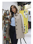
NEOBLU ALFRED WOMEN 03177