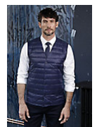
NEOBLU ARTHUR MEN 03172