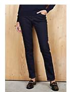
NEOBLU GASPARD WOMEN 03181