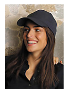
NEOBLU TOM 03204