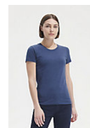
SOL'S REGENT FIT WOMEN 02758