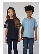
SOL'S Imperial KIDS 11770