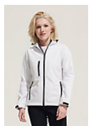
SOL'S REPLAY WOMEN 46802