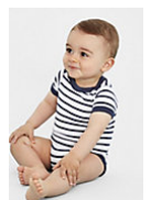
SOL'S MILES BABY 01401