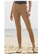
SOL'S JULES WOMEN 01425