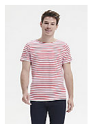
SOL'S MILES MEN 01398