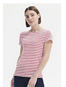
SOL'S MILES WOMEN 01399