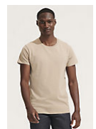
SOL'S CRUSADER MEN 03582