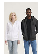
SOL'S CARTER 03812