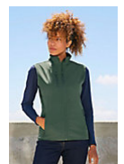
SOL'S FALCON BW WOMEN 03826