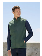
SOL'S FALCON BW MEN 03825