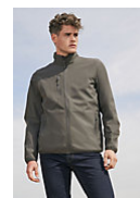
SOL'S FALCON MEN 03827